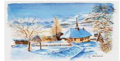
St Bernard's, Wengen

Please reserve your place by: 15 April 2005